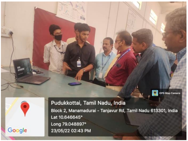
Students answering the questions raised by juries